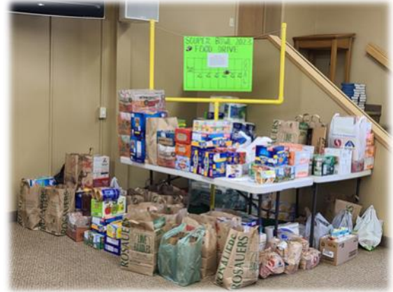
"Souper Bowl Sunday" 2023

With your help Christmas Angel Tree 2023 was a success!! Thank you all who purchased gifts, bought gift cards, and signed Christmas cards for the incarcerated parents, AND delivered the gifts.